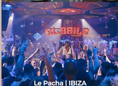
Le Pacha | IBIZA