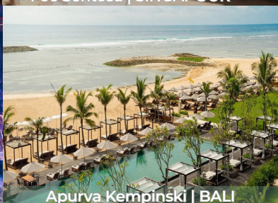
Apurva Kempinski | BALI