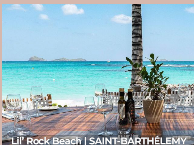
Lil' Rock Beach | SAINT-BARTHÉLEMY

Château l'Escarelle wines are widely served in some of the most prestigious restaurants in both France and further afield.