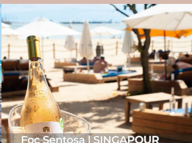
Foc Sentosa | SINGAPOUR