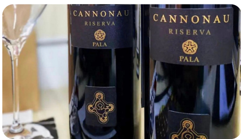
PALA CANNONAU DI SARDEGNA RISERVA