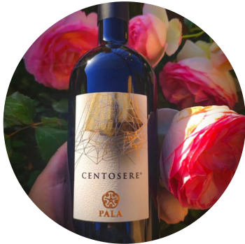
PALA CENTOSERE CANNONAU