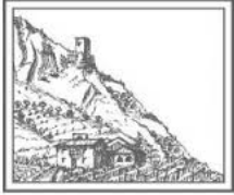
Kellerei Cantina Terlan

Congratulations to everyone at Terlano! New scores for Terlano in Wine Enthusiast (04/01/16)!